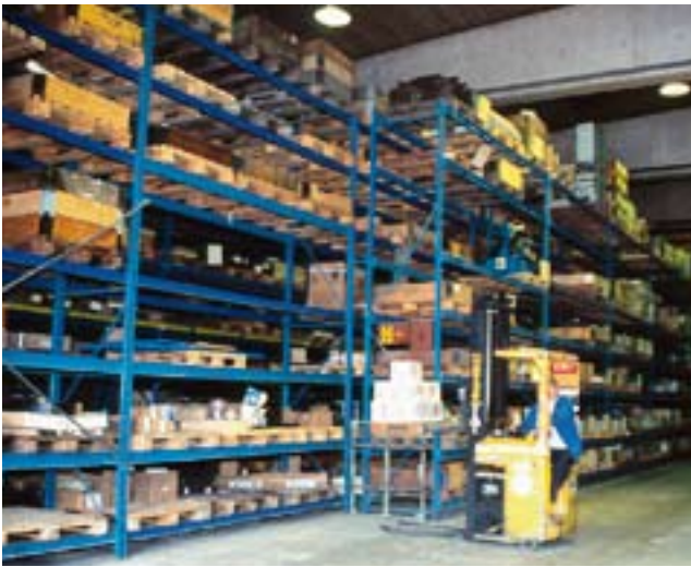
Professionally skilled maintenance and modernization as well as an extensive store of spare parts make HEINOLA a reliable business partner.