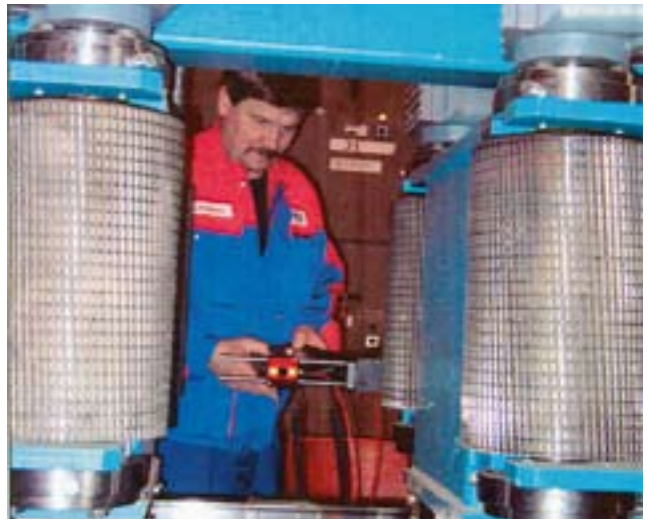
The sawline scanning is carried out precisely and rapidly with a laser measuring device. The bearing conditions are checked with SPM equipment.